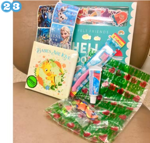
When my dentist is done I get a bag with my own brush, and I get a prize for being a good helper.