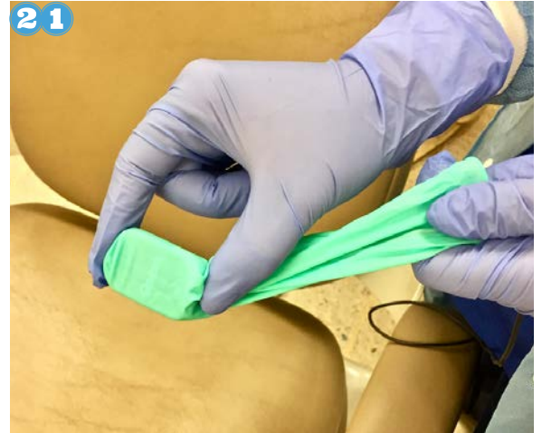
I will bite on a special cookie when the dentist takes a picture of my teeth.