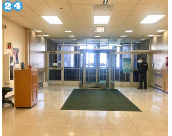
I did a great job at the dentist and it's time to say goodbye.