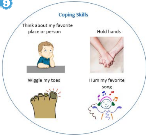
I can do things to make myself feel better if I get scared.