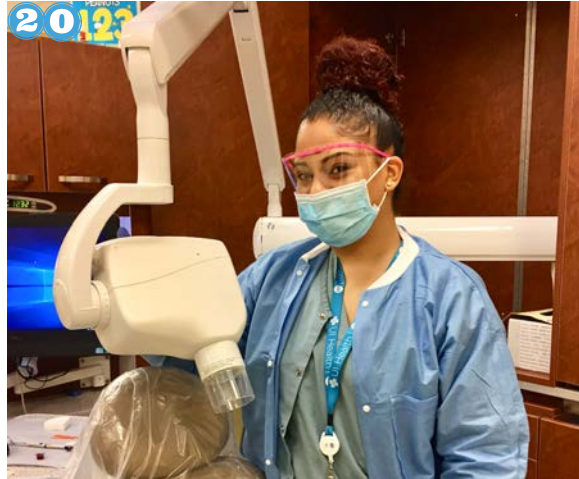
My dentist has a special camera to take pictures of my teeth.