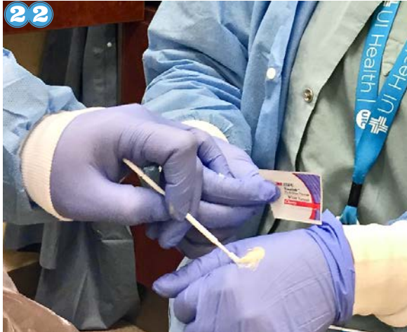
My dentist paints my teeth with special vitamins to make them strong.