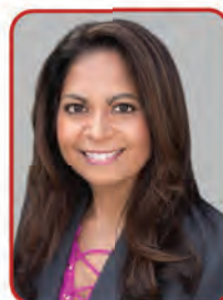
Dr. Sheela Raja Resilience Center