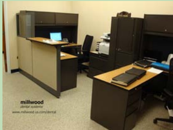
Administrative Office Reception Area

Through your generosity and support, the Alumni Association was able to contribute almost $65,000 in 2012 for the purchase of furniture for the recently renovated clinic lecture rooms, instructor area and administration offices. Your Alumni Association dues have been instrumental in creating a state of the art