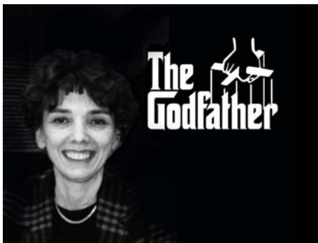
A Salute to the Faculty